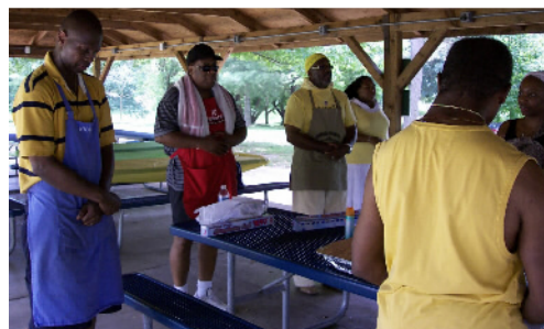
Offering thanks and blessings for the food before the meal begins

Sabayet hosted a glorious program complete with vendor booths, and a pageantry of entertainment for those in attendance. It was a wonderful occasion to do some networking with others in attendance and to share our message with the community. This is an event that we are currently planning to participate in again next year.