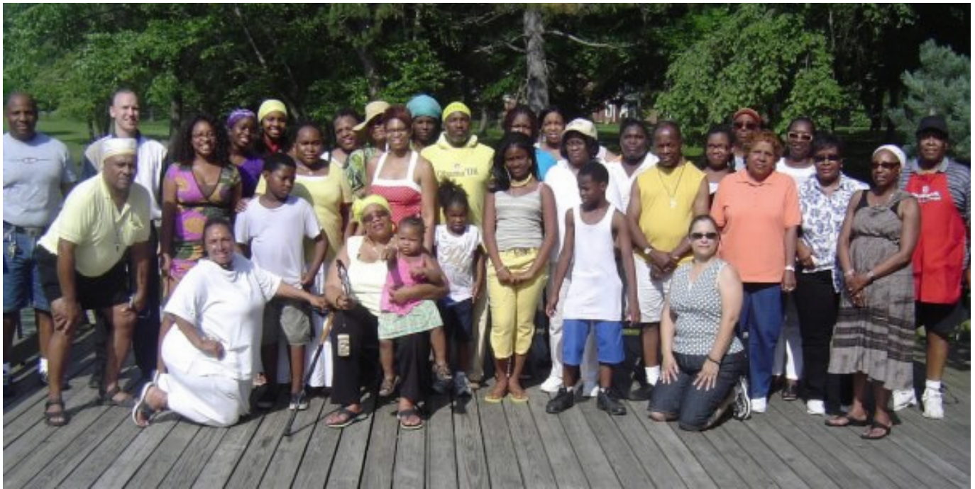
Our guests took time out from the festivities to take a group picture. See anyone you know?