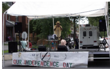
The Grand Stage of the Juneteenth Celebration from which many splendid and talented performers entertained the crowd.

celebrating Juneteenth. Juneteenth is the celebration of the day that the news that slavery had been abolished finally reached our brothers and sisters in parts of the South where the rule of slavery was still being enforced.